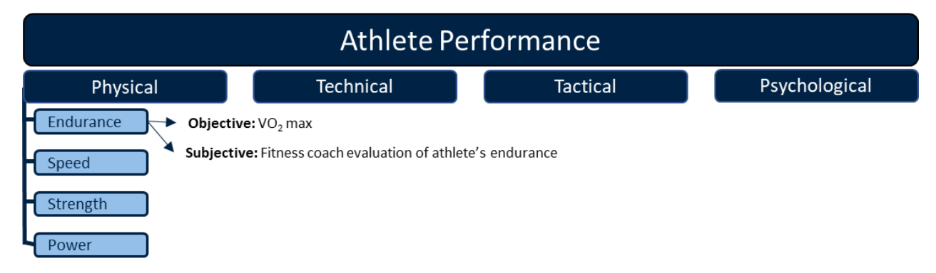
Figure 1 - A simplified visual breakdown of where endurance fits into the realm of overall athlete performance.